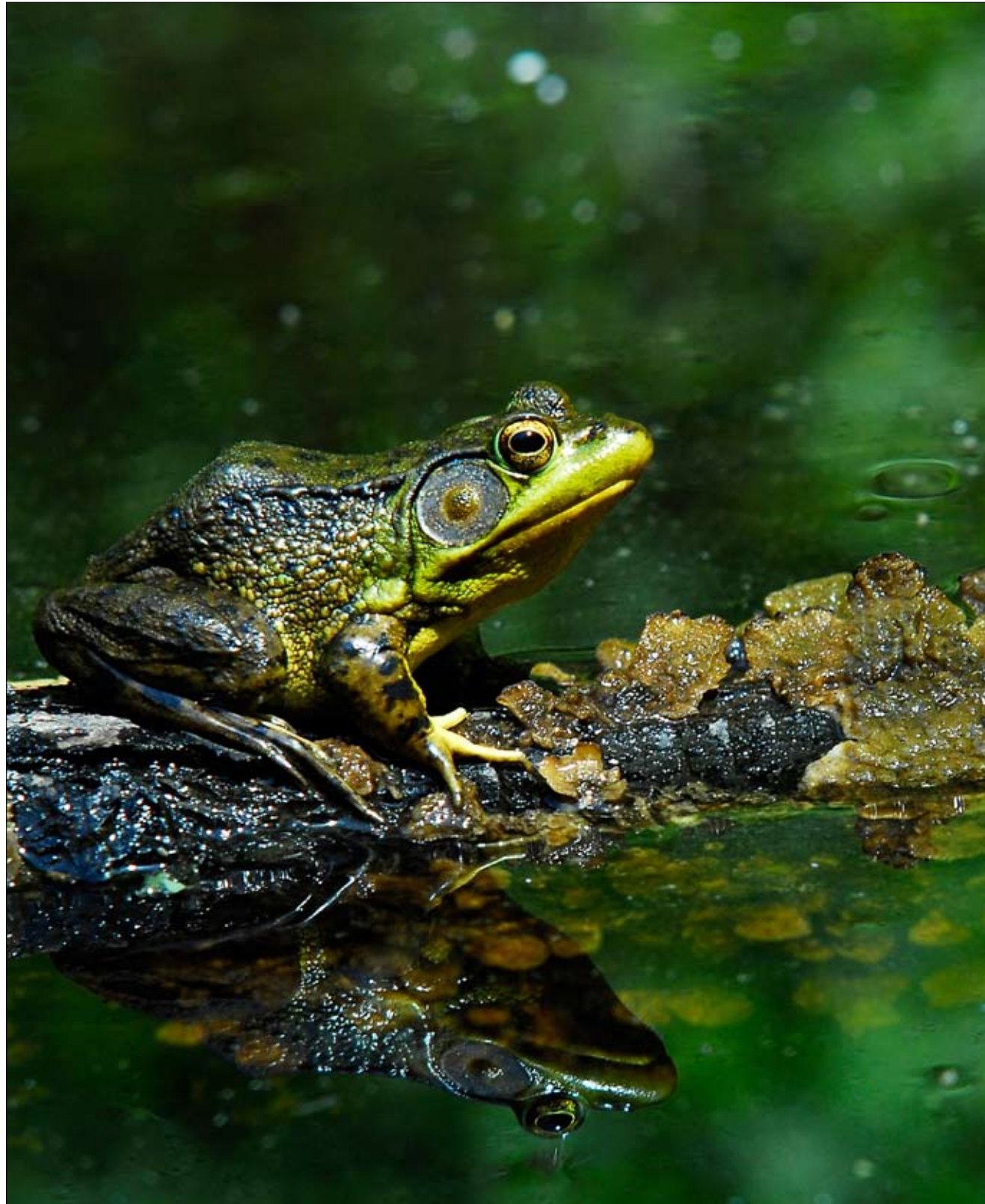
A frog sits on a log watching its reflection as it waits for passing flies in one of the many secluded ponds along Dead River in Marquette on June 11, 2007.