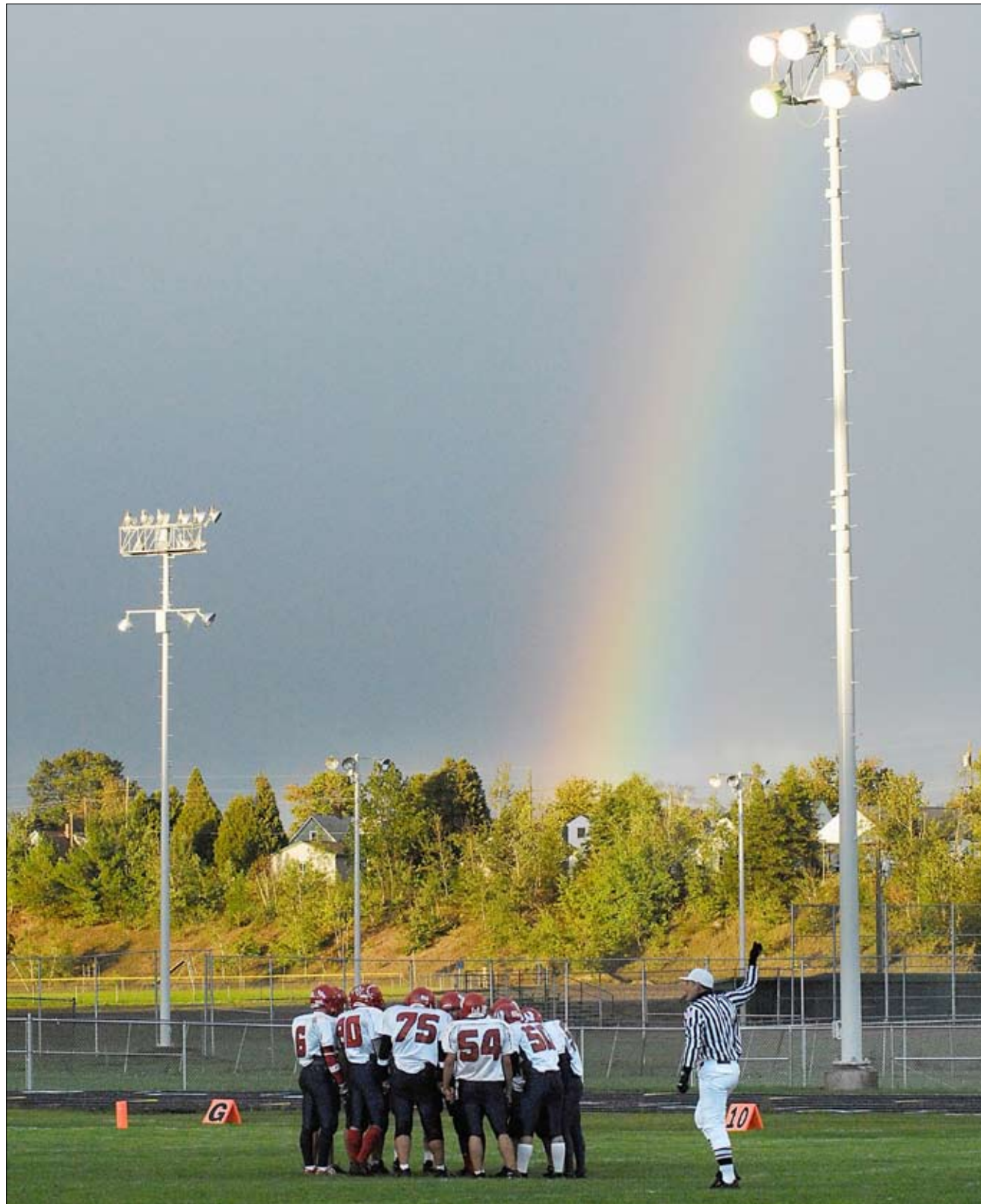
A rainbow shines down on the Westwood High School football team before its game against Ishpeming game at the Ishpeming Playgrounds football field in Ishpeming on September 14, 2007.