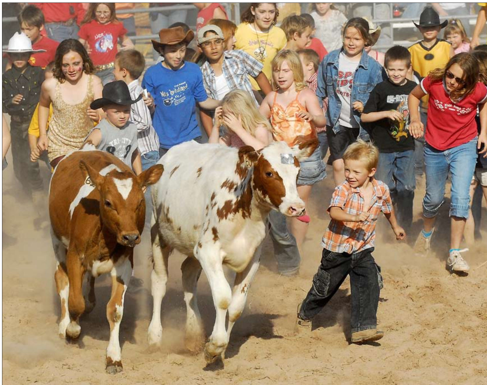
A group of children chase after two calves during the calf scramble at the second annual Sawyer Stampede Rodeo at K.I. Sawyer on June 16, 2007. The kids removed strips of duct tape from the calves to win prizes.