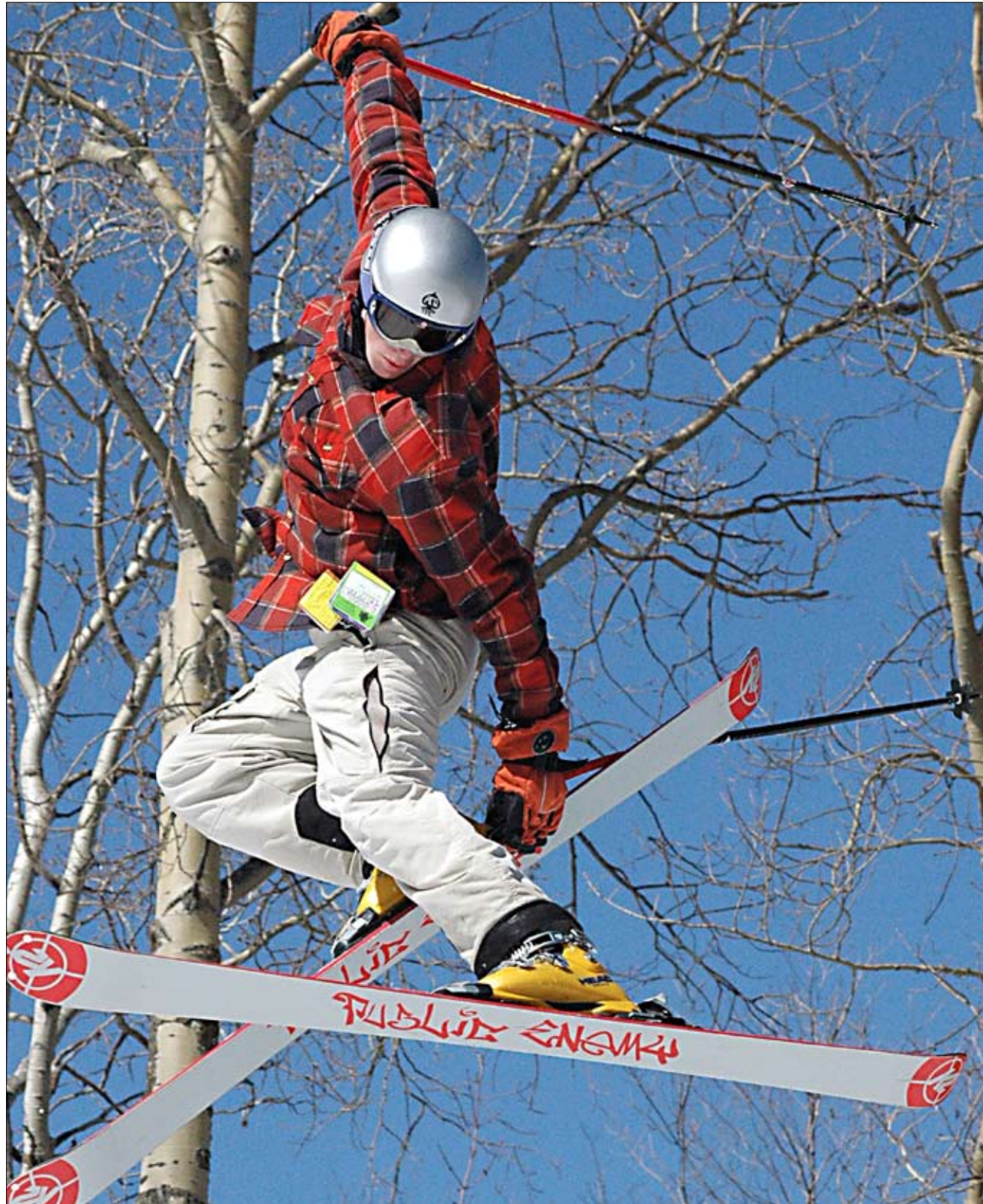
A skier flies through the trees as he catches air off a twenty-five foot high ramp during the Midwest Superpark ski and snowboarding competition at Marquette Mountain on April 17, 2004.